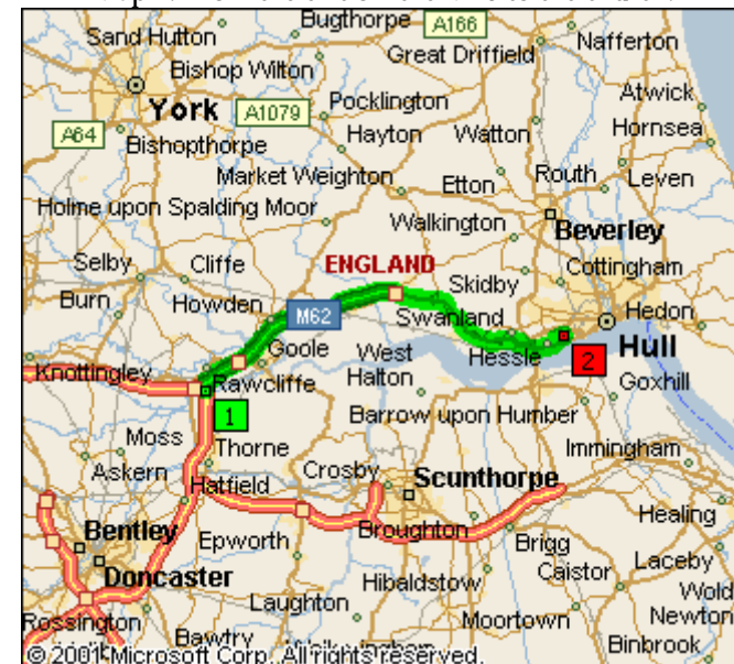
Map 1: From the exit off the M18 to the church: