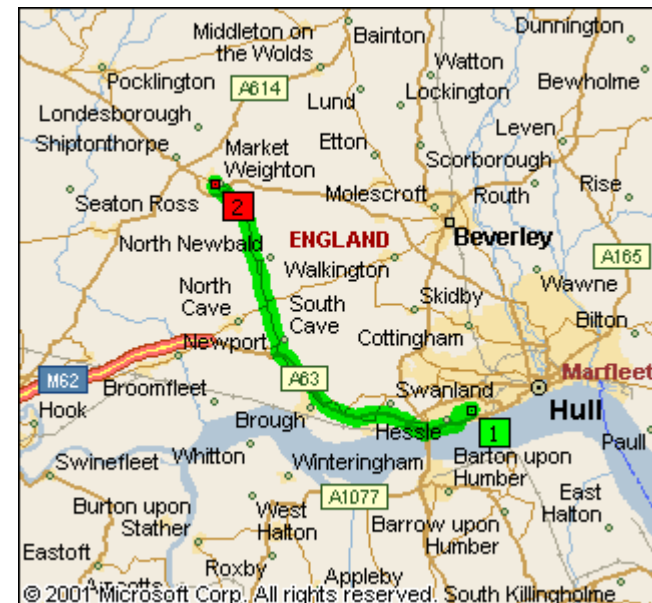
Map 3: From the church to the Londesborough Arms hotel:

Website: http://www.s-h-systems.co.uk/hotels/londesborough.html